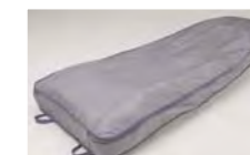
Deluxe padded storage bag is standard.