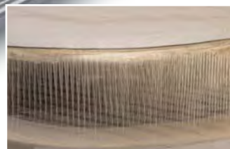
Achilles high-pressure, drop-stitch AirFirm™ floors provide superior rigidity.