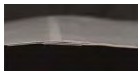
Side View of Achilles Seam

Our seams are overlapped a full inch and reinforced with seam tape both inside and out. No one else takes so many steps to ensure seams will last.