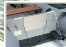
HEAVY-DUTY SELF-BAILER AND ALUMINUM-PLATED TRANSOM.

*International Orange available as special order only