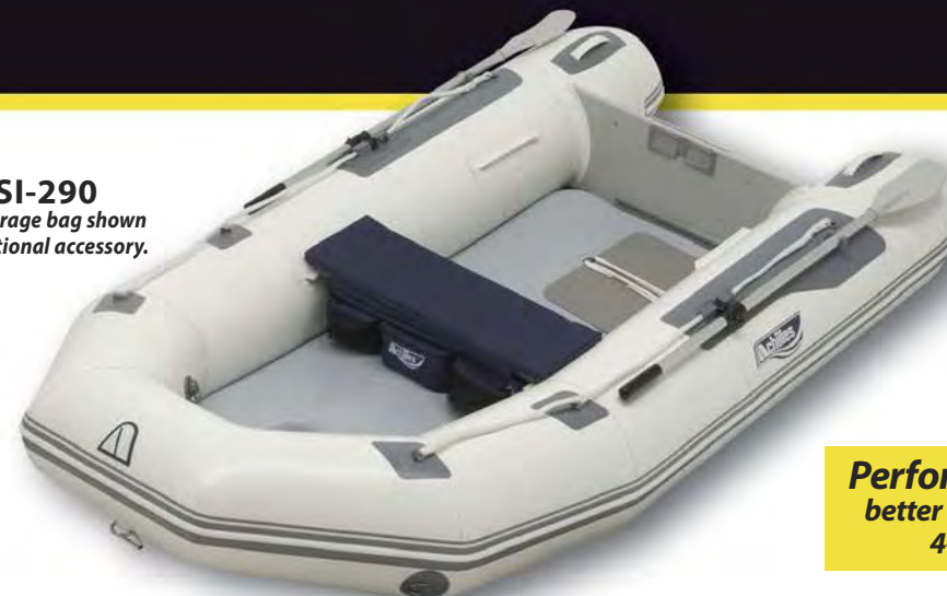
Extra Seat Attachment Patches On LSI-290, 310, 335 and 365.

Performax tubes perform better with today's heavier 4-stroke motors.