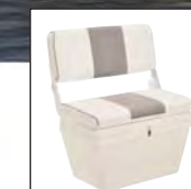
Fiberglass seat with cushion