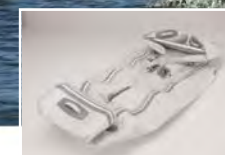
Easy to fold and store