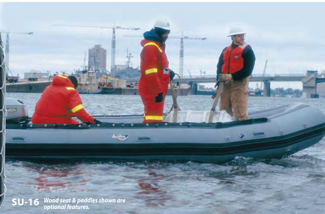
SU-16 Wood seat & paddles shown are optional features.